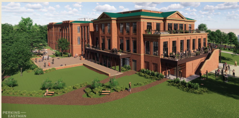
View of the future U.S. Naval Academy Alumni Association and Foundation Center from College Creek.

Nearly 60 years ago in 1961, then-Chief of Naval Operations Admiral George Anderson '27, USN, said, "The Navy has both a tradition and a future—and we look with pride and confidence in both directions."