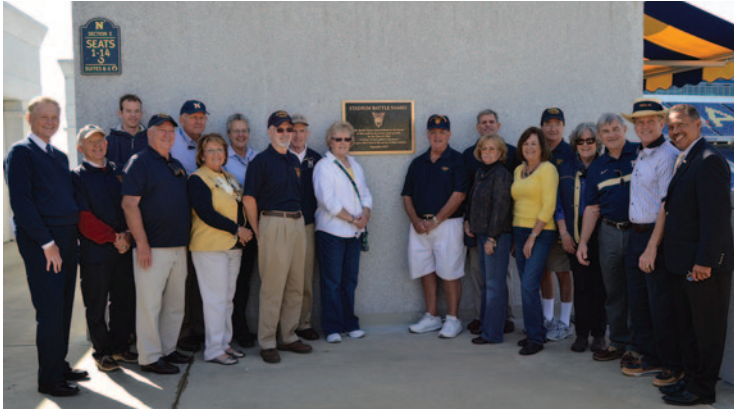
'66: CLASSMATES AND SPOUSES AT THE DEDICATION

was to accomplish that project. The attached pictures were taken during Homecoming in October 2012. They record the mini dedication ceremony conducted to mark the placement of the plaque acknowledging our Class' sponsoring the renaming effort. The plaque is located on the second level of the east end of the stadium, facing the Gold side. Anyone attending a game this year should stop by and see it. Thanks to Tom for raising this as a point of interest to the Class.