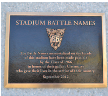
BATTLE NAMES DEDICATION PLAQUE

was to accomplish that project. The attached pictures were taken during Homecoming in October 2012. They record the mini dedication ceremony conducted to mark the placement of the plaque acknowledging our Class' sponsoring the renaming effort. The plaque is located on the second level of the east end of the stadium, facing the Gold side. Anyone attending a game this year should stop by and see it. Thanks to Tom for raising this as a point of interest to the Class.