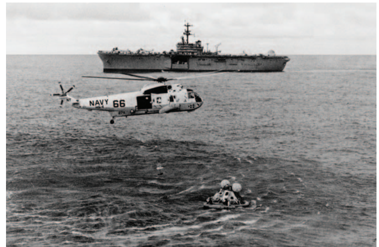
'67: APOLLO 13 Recovery