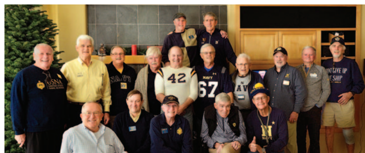
'67: San Diego Army-Navy 2019